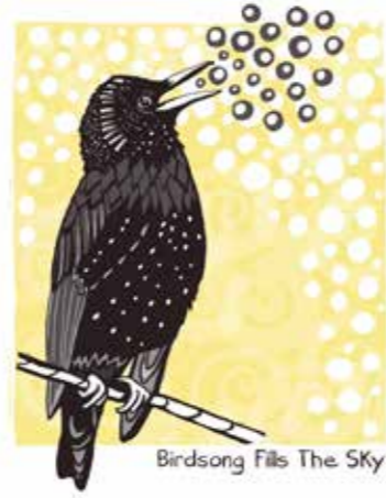
Birdsong Fills The Sky

15 – 20 May Birdsong Fills the Sky – Although some birds sing throughout the year, others wait until spring when the days are longer and they start to mate. Which birds are singing the loudest?