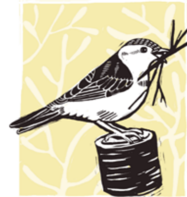
The Sparrow Builds Her Nest