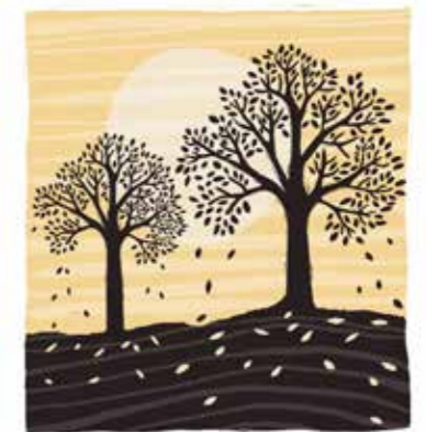
Trees Drop Their First Leaves

13-17 September Tree's Drop their First Leaves – And just like that autumn is here!