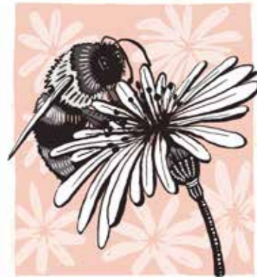
Bees Are Busy

16 – 20 June Bees are Busy – The buzz of bees is the soundtrack to sunny days, as they are busy collecting pollen and nectar.