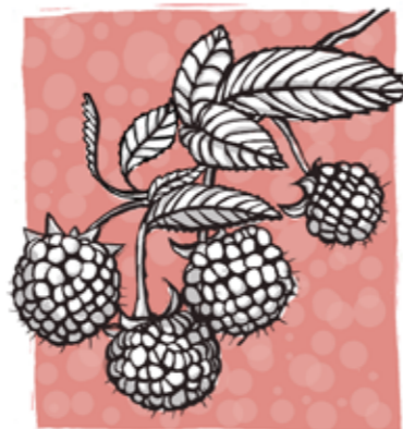
The Raspberries Turn Red

12 – 16 July The Raspberries Turn Red – It's time to get picking