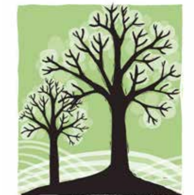
Trees Turn Green Again

Trees Turn Green —The leaves are back! After being bare for so long, the landscape is starting to change and our favourite trees are ready for spring and summer.