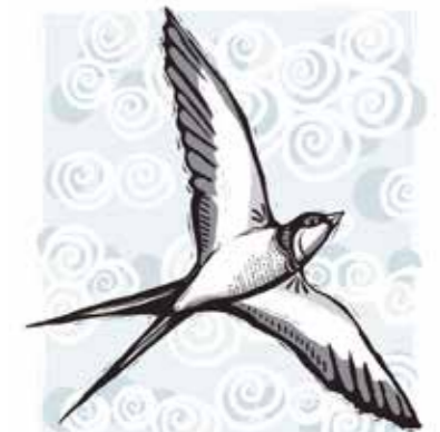
The Swallows Arrive

The Swallows Arrive —Swallows start to arrive after their long journey from Africa. They will nest and spend the summer here before returning. Have you spotted any yet?