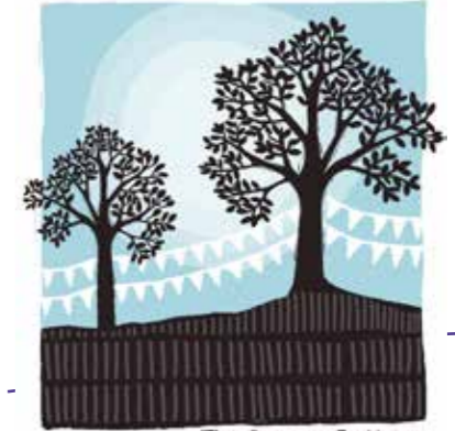
The Breeze Is Hiding

3-7 August The breezing is hiding – Does the air feel quite still and warm?