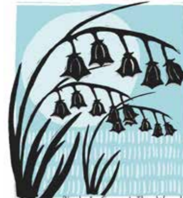
Bluebells Carpet The Woods