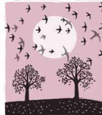
The Swallows Leave

16 – 20 June Bees are Busy – The buzz of bees is the soundtrack to sunny days, as they are busy collecting pollen and nectar.