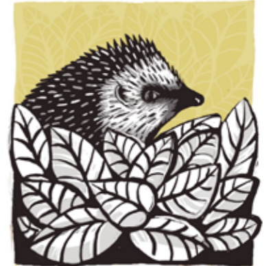
Hibernating Creatures Open Their Doors

Hibernating Creatures Open Their Doors —Hedgehogs start to appear, sleepy after a winter of hibernation. Have you seen any or any signs of them nearby?