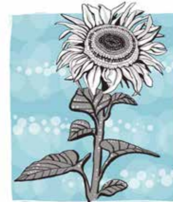
The Sunflower Stretches High

26 – 30 May Cow Parsley Lines the Hedgerows - Cow parsley is a notable plant sitting under the hedgerows, particularly alongside roads.