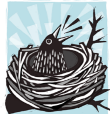
The Blackbird Fledglings Leave the Nest

6-10 June The Blackbird Fledglings Leave the Nest – Baby birds are ready to go! If you have been keeping an eye on a blackbird nest, keep watch to see if the babies fledge.