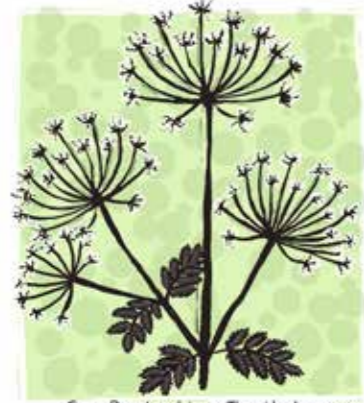
Cow Parsley Lines The Hedgerows

26 – 30 May Cow Parsley Lines the Hedgerows - Cow parsley is a notable plant sitting under the hedgerows, particularly alongside roads.