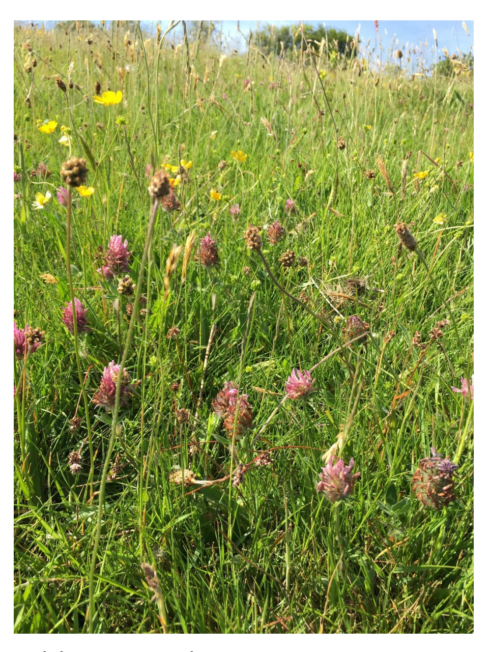
Cockshotts Farm meadow May2020