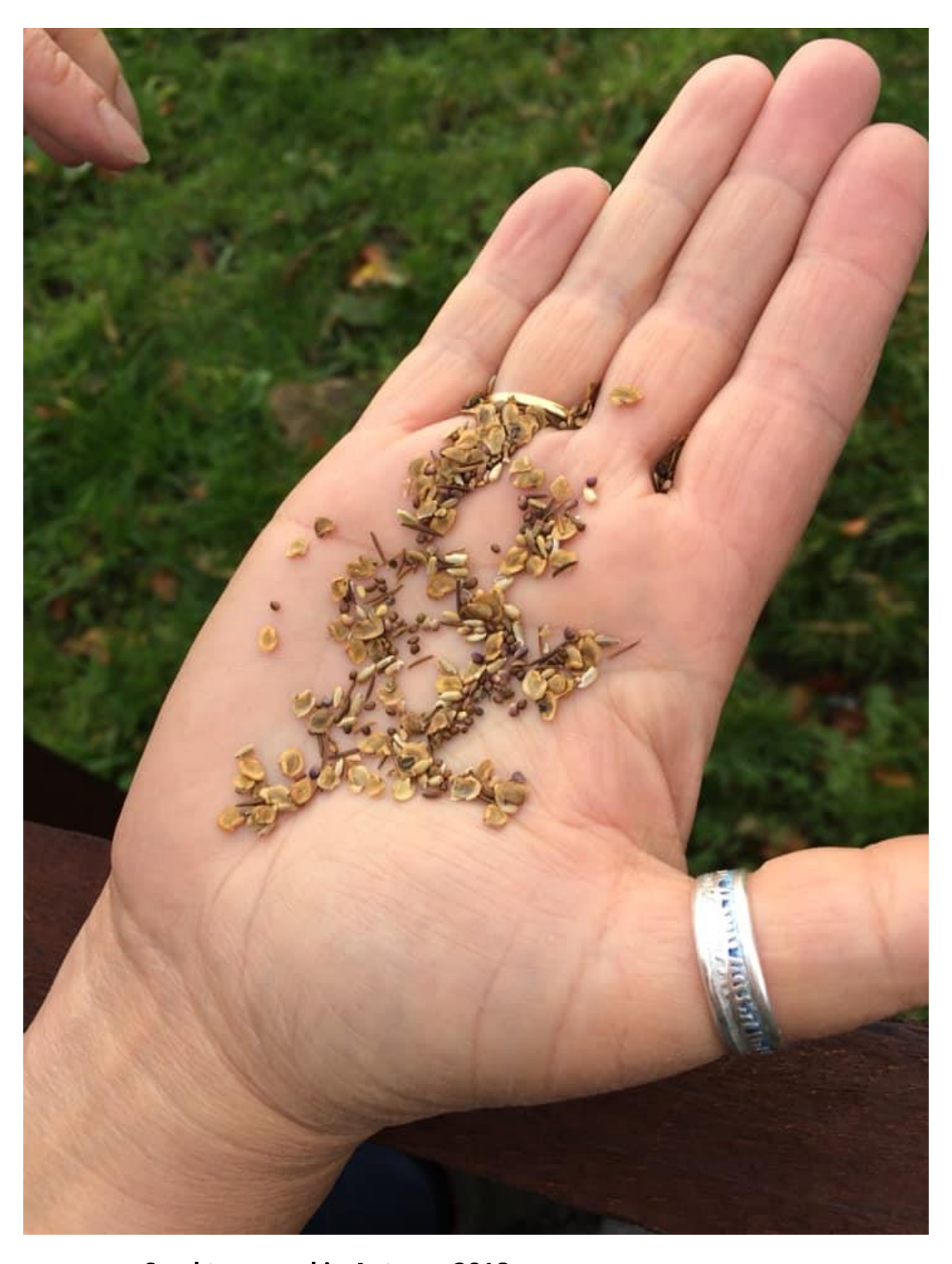
Seed to spread in Autumn 2018