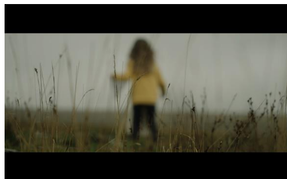
Stills from the film 'Sowing in Time'