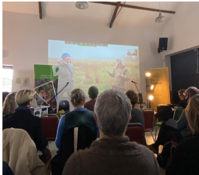
Images from The Peat Symposium