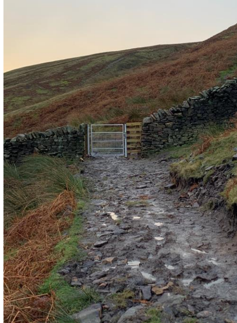
The new gateway at Ogden, before and after works