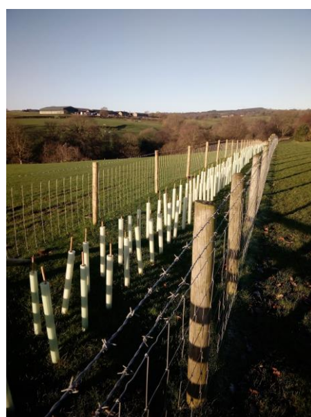
Two of the newly fenced, banked and planted hedgerows at High Whitaker Farm