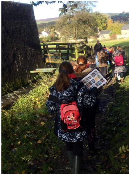
Children from Chatburn Primary school exploring their local heritage whilst developing the village Treasure Trail

Two new businesses have signed up to the Sustainable Tourism Network – Rimington Caravan Park and Hamish's Café and both are keen to link with the wider tourism opportunities offered through the AONB network. Hamish's are also cooking their own version of Pendle Peat Pie!