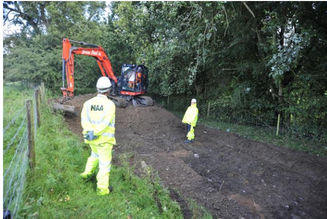
NAA archaeologists supervise digging of the trench

An article has also been submitted from NAA to Itinera , the journal of Roman Roads Research Association.