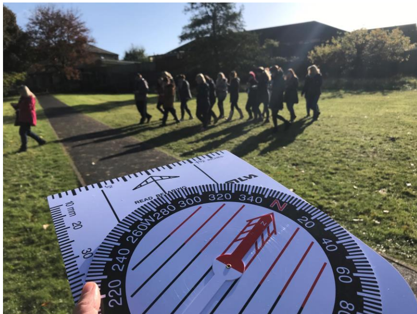
Teachers at Lowerhouse Primary learning outdoors

The outdoor learning sessions were wrapped up with a 3-hour teacher training session at the school grounds.