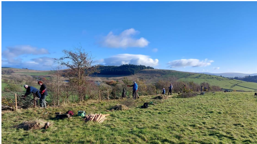
Volunteers learning the art of hedge laying at Overhouses, Barley

We are now in our final hedgelaying and planting season and we have been busy! A very successful two-day training course was held during the weekend of 13/14 November, with 16 participants on day 1 and 18 on day 2 (which included the farmer). All the participants were beginners and they made excellent progress laying 176 metres of young mixed hedge running up the hillside at Overhouses Farm near Barley. Two experienced trainers, Joe Craig and David Whitaker from the National Hedgelaying Society provided expert tuition. Due to continued interest and demand from the public, we will hold a second course in February.