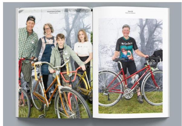
Two double page spreads from the 'I Am Clarion' book