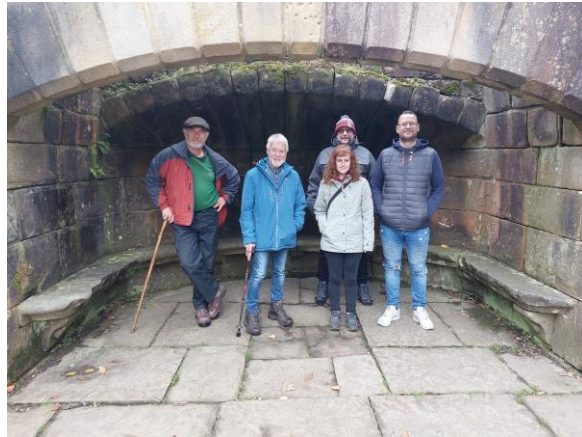
Christmas wreaths made by PEN participants (left), and the group enjoying a walk around Wycoller

The minibus pick-up service continues to be under-utilised compared to pre-covid however, we know there will be individuals who will wish to use this transport service in the new year and so hopefully we will be able to keep our partnership going with Little Green Bus.