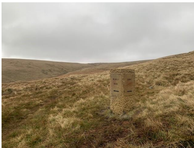
One of the four new stone waymarkers installed on Pendle

However, we have had some fantastic work done by Field and Fell who have installed the new stone way marker posts at 4 new locations on Pendle Hill. This will continue to aid walkers when visibility and mobile reception are both hard to find.