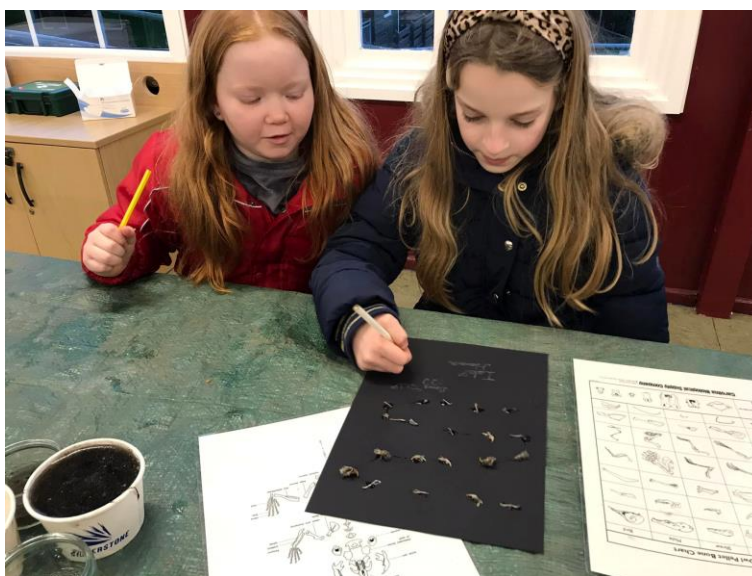
Girls enjoying identifying the prey of an owl after dissecting a pellet

During February half term, we ran an Owl Pellet Dissection event as part of the Forest of Bowland AONB's Dark Skies week at Whitehough Outdoor Centre. 21 Adults and 32 children learnt about owls, what they eat and how they produce a pellet. A mum commented, "it was honestly one of the best activities I've done with my boys to date. I'm on the hunt for an owl nesting tree so I can find my own pellets! Thanks so much, they had much to talk about at school today."