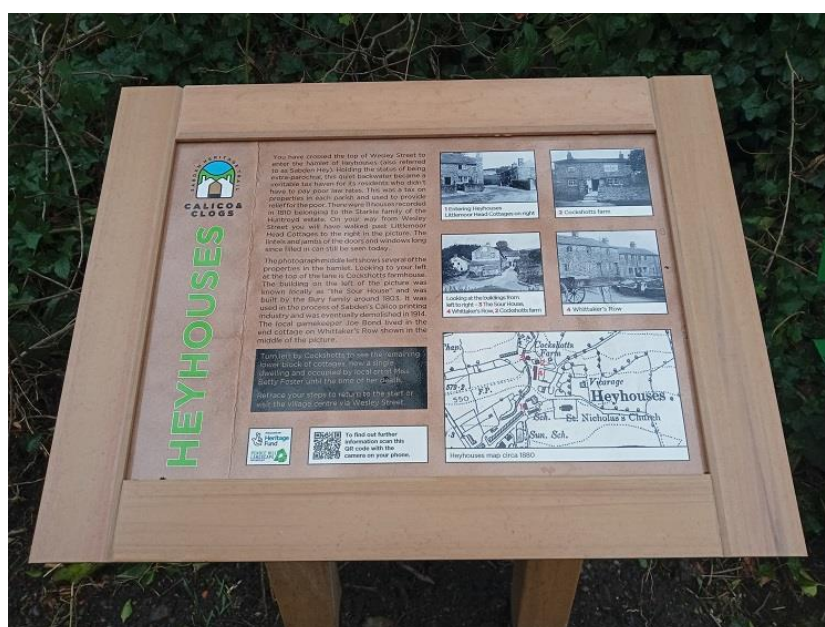
An information panel from the Calico & Clogs Trail in Sabden

https://www.sabdenparish.org.uk/heritage-trail.php