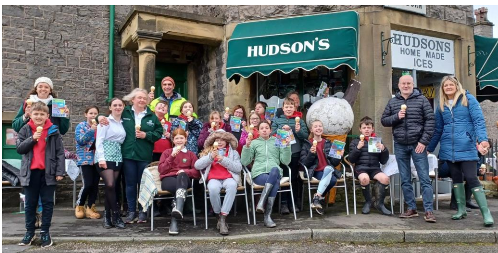
Launch of the Chatburn village Treasure Trail