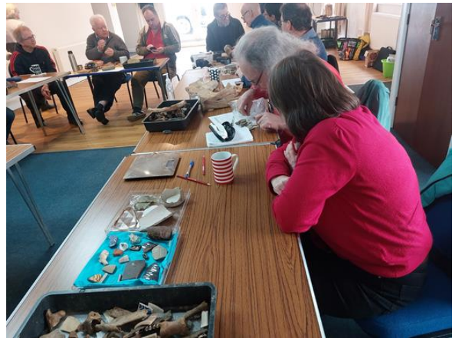
Volunteers at the 'finds' training session

NAA delivered a Finds Identification Training Session to a group of 13 volunteers. This was a great session because volunteers were invited to bring their own archaeological finds along. There was a lot of discussion and lots of questions.