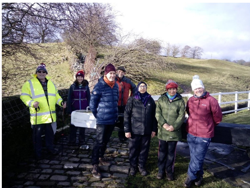
Participants on one of our Monday PEN Walks near to Barrowford Locks

We have delivered a further 7 walks on a Monday afternoon – on and around the Landscape Partnership area. We have also delivered 4 more winter activity sessions. These have included a session making bird boxes at Offshoots (Burnley), a trip to Clitheroe Castle, a Treasure Trail around Chatburn and another mindfulness/forest bathing walk delivered by Stacey Mckenna-Seed.