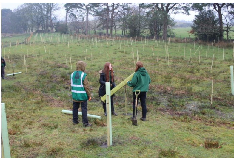
Plastic and 'eco friendly' tree guards being examined by pupils at Whins House woodland