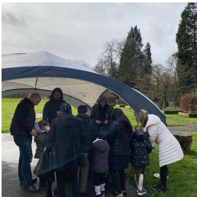
Cyanotype workshop held in February half term

Additionally, Corky has found a new home for the winter in a shed at a local farm. A local farmer has agreed to host Corky to prevent damp developing and further leaks. This is a great start to putting provisions in place to enable Corky to be a valuable asset beyond the conclusion of the partnership programme.