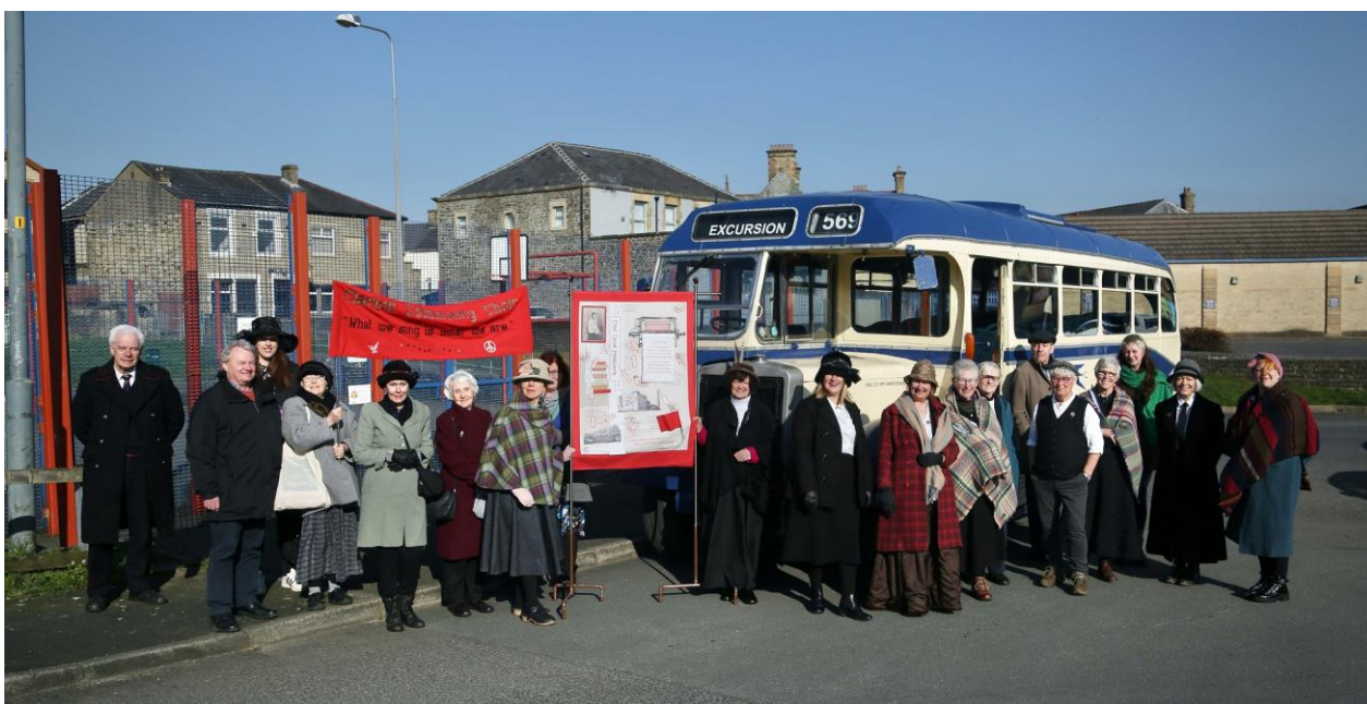
The IWD tour bus ready to depart from Nelson