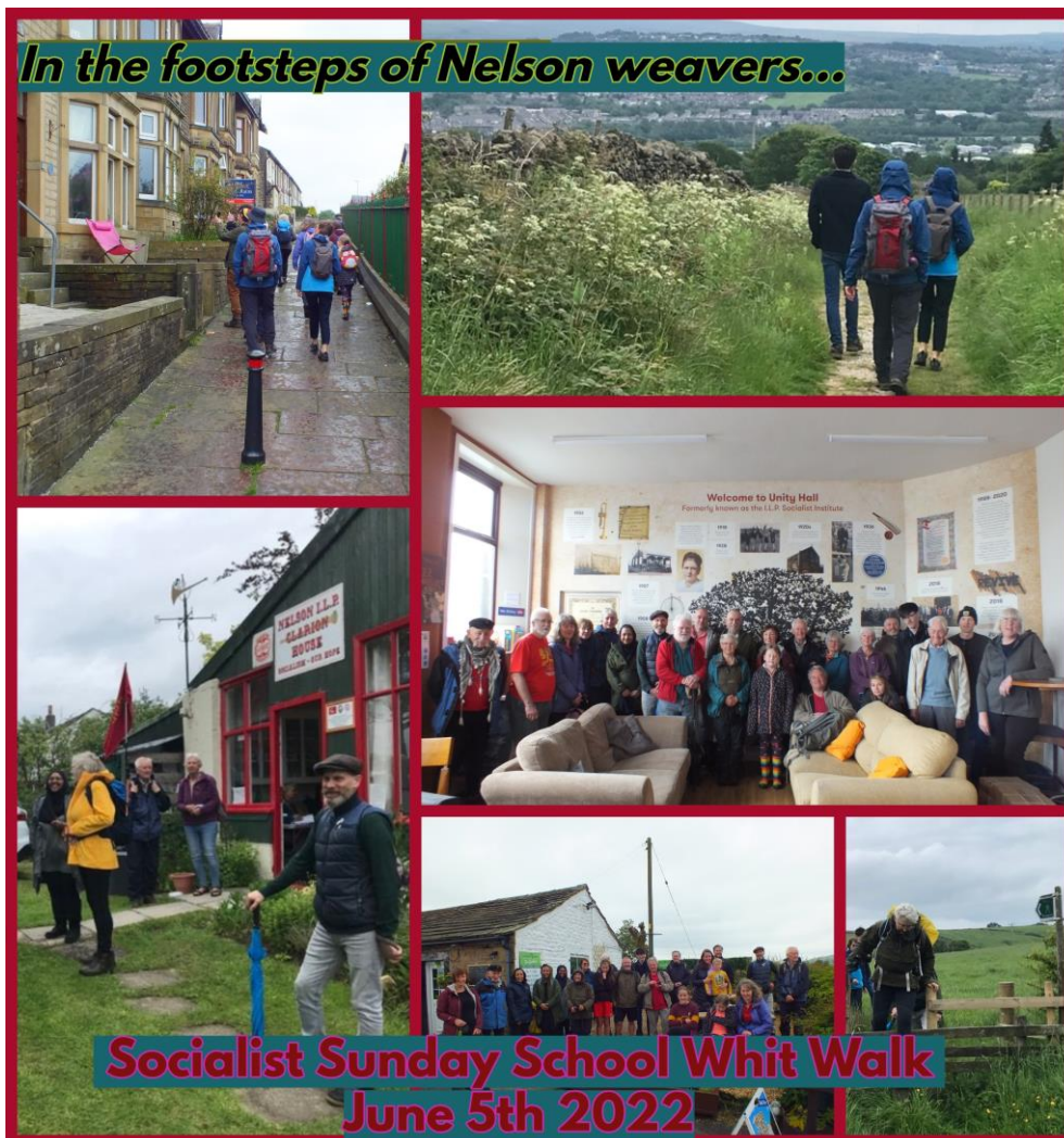
Audio Recordings taking place on Clarion Sunday (above) and the 2022 Whit Walk, both supported by MPA and the Pendle Radicals team