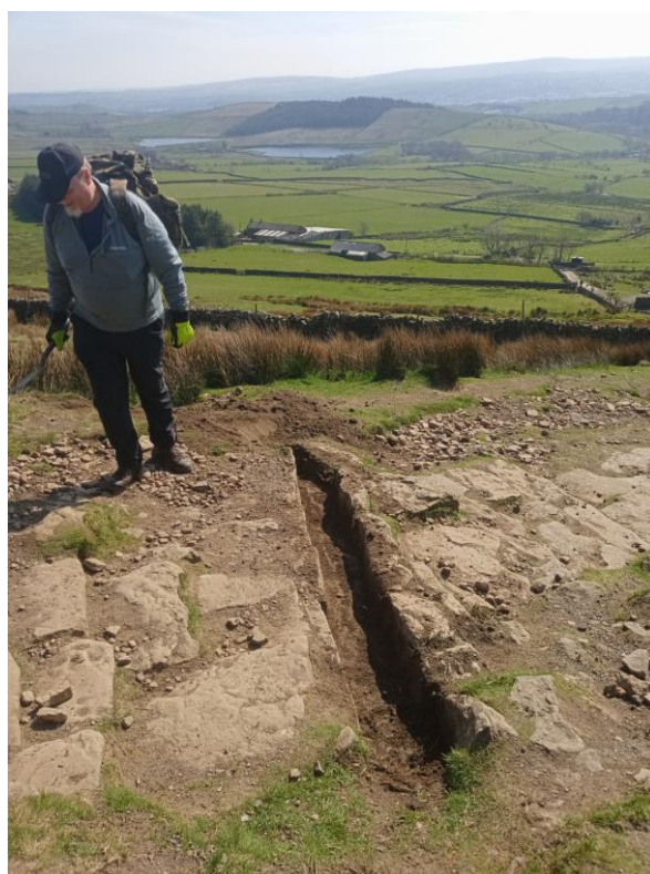
Our regular volunteer task, clearing the water bars of accumulated stone on the steep path up Pendle