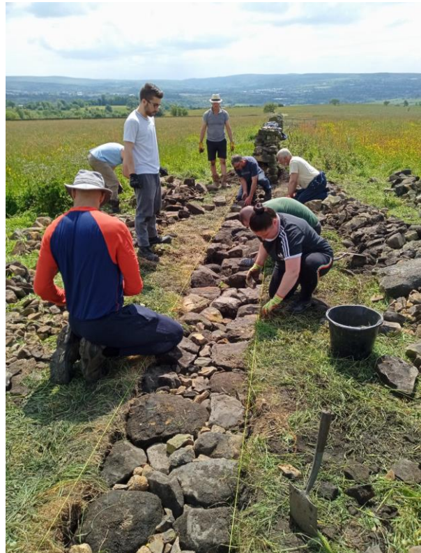
Walling at Ashlar House: left the PEN group, and right from the 2 day Beginners course