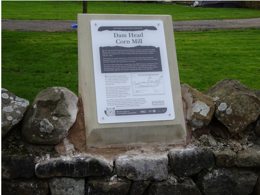
One of the heritage plaques installed at Roughlee

The one remaining project, a summer activity camp led by Burnley Pendleside Rotary , will take place in August. This will provide short breaks at Whitehough camp for local children and their carers who might otherwise not get away from home or explore the local countryside in the summer holidays.