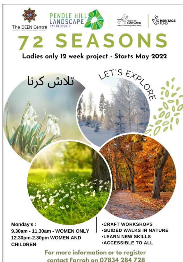
Poster for the project

Chris has also been supporting the boys group who participated in a 72 Seasons nature trial in Victoria Park and some den building in Wycoller woods.