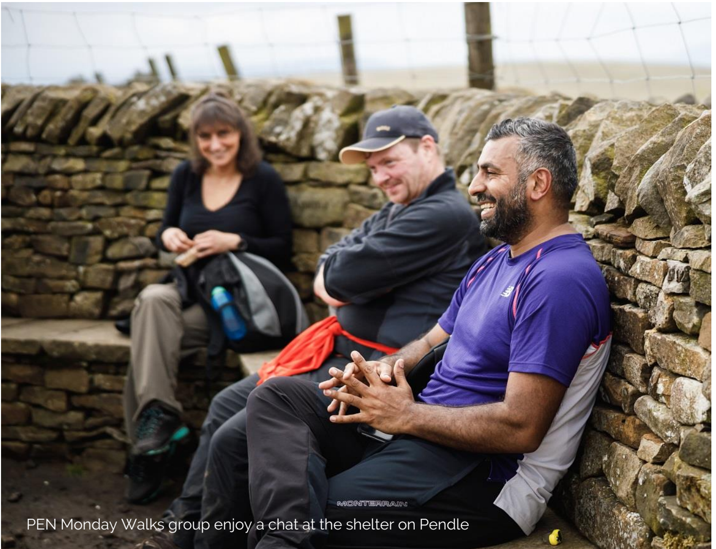
PEN Monday Walks group enjoy a chat at the shelter on Pendle