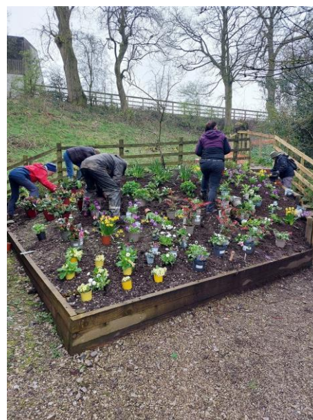
Completed work in PHC grounds: new steps, wildlife cameras and volunteers work on a naturalistic planting bed

Burnley Youth Theatre's Pendle Pioneers project have made two interim claims to cover project management, resources for film costume & props, and marketing as detailed on the application. Their project will reach completion soon now.