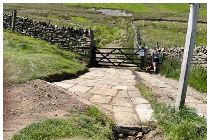
Completed flagged entrance and water management at Pendle steps