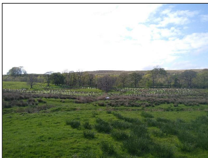
Woodland creation at Whins House, spring 2022