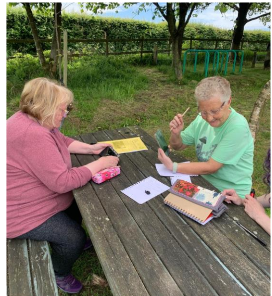
The Monday Walks group tackle Barrowford Locks, and the Thursday group 'Moving to Change' in Spring Wood (left) and identifying plants at Clarion House