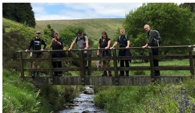
Celebrating Volunteer Week with a walk and picnic for PHLP Volunteers

A teaching assistant at a local school has become a new learning volunteer and has been inducted and started volunteering at Little Saplings. She is gaining valuable first-hand experience while she undertakes her Level 3 Forest School training. Another Outdoor Learning volunteer has recently gained a paid position at a local Forest school nursery and will be continuing volunteering with PHLP over the summer holidays.