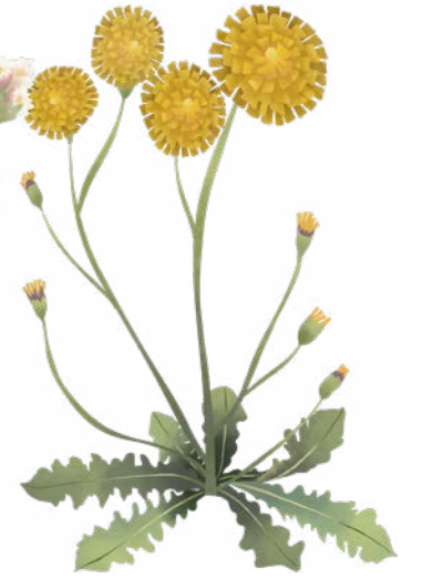
Common cat's ear