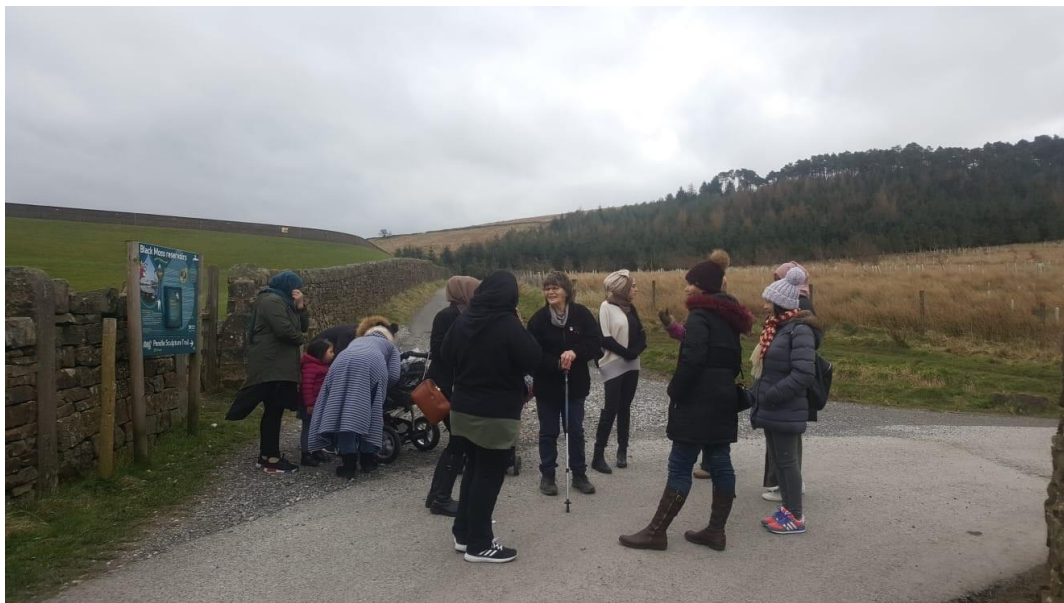
ZK Arts – Rise Up project visiting the Pendle hill area for artistic inspiration

We have started to think about plans for Year 2 and the Fund will re-open for applications on 18 th August. Panel members were re-appointed at the end of June, with the addition of two new members.