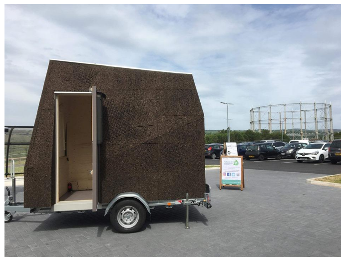
Talkaoke session at the Gathering Event, and the new Pendle Hill Mobile Hut

Attendees were also invited to contribute to the Pendle Hill Memory Map: What the Hill Heard by providing an anecdote, fact, memory or drawing that Pendle Hill has witnessed.