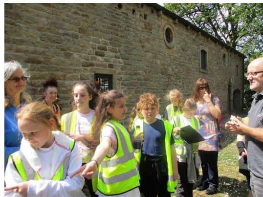
Pupils involved in developing a treasure trail for Barrowford village