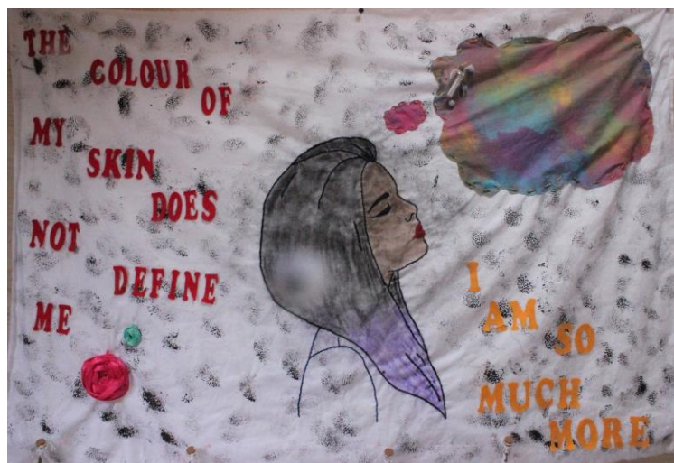
Work in progress, and a completed banner created by GCSE Textile students at Marsden Heights