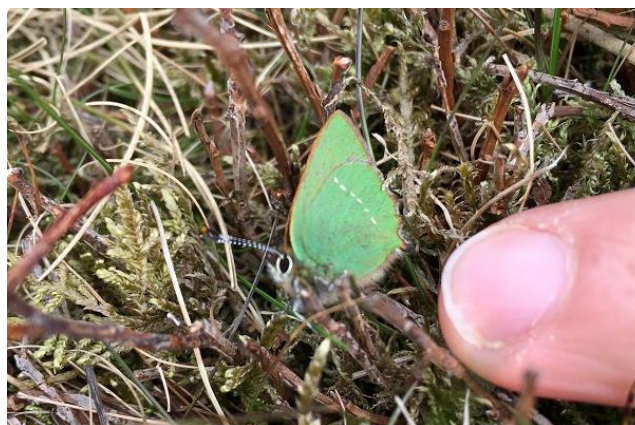
Green Hairstreak butterfly on Pendle, 2 May 2019