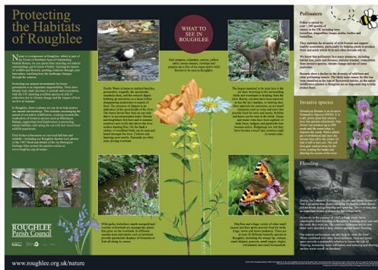
Roughlee Habitat project – new interpretation board