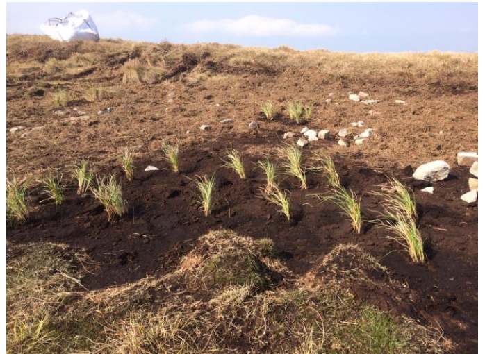
Staff and volunteers carry plants up the hill, ready for planting into the bare peat at the Engagement Day