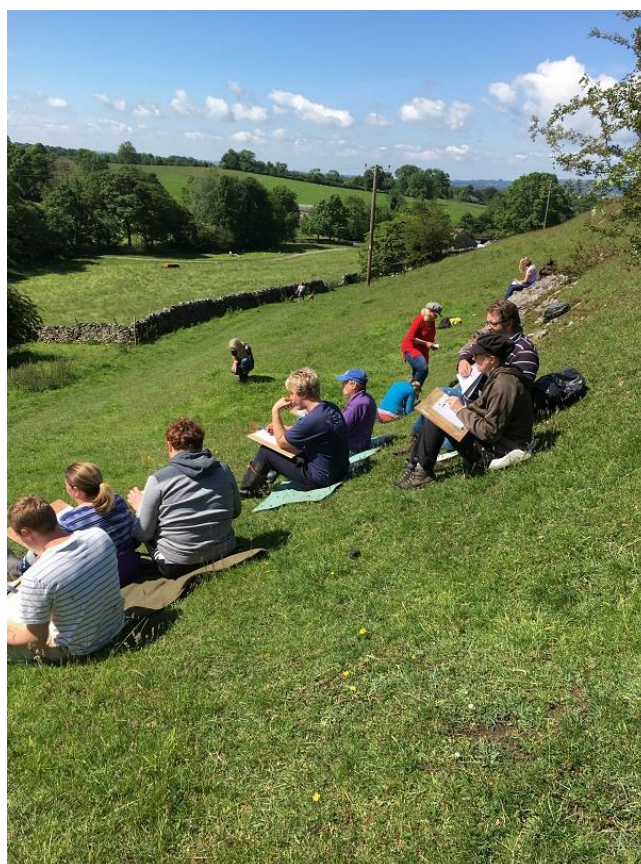
Artists and botanists at Worsaw Hill