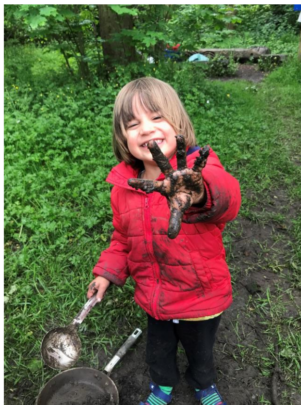
Little Saplings activities: Dad den building and mud kitchen