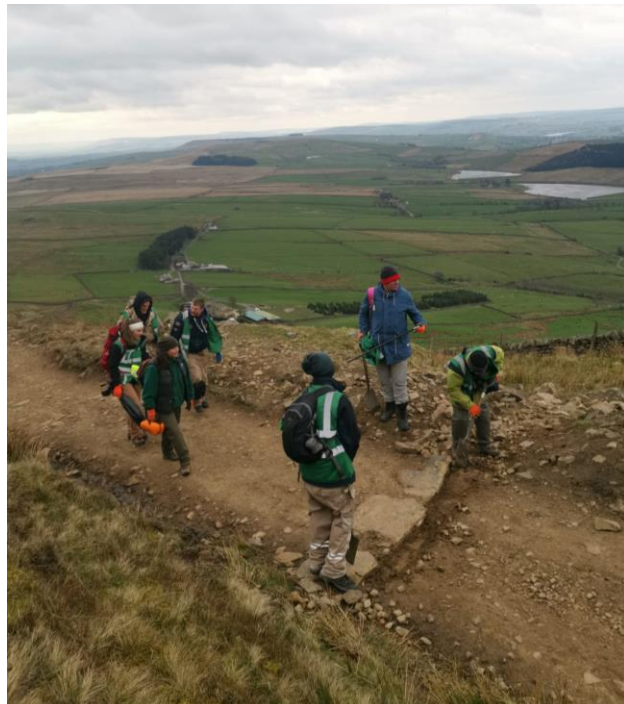
PEN activity sessions walking and working in the landscape